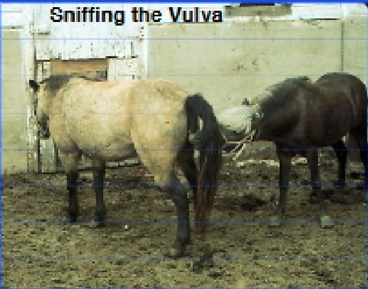
Sniffing the Vulva