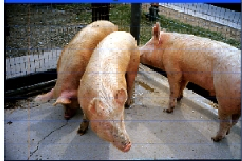
Sniffing the Vulva