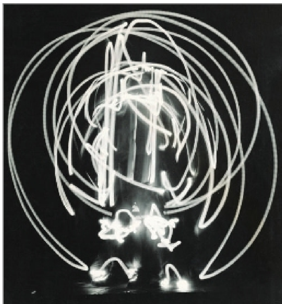
Daily operation: the light traces of a person getting dressed show that even simple tasks require complicated movements.