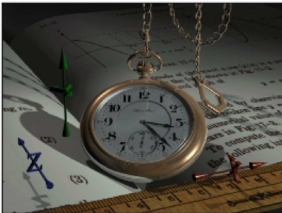
POCKETWATCH Kevin Ódhrain POV-Ray