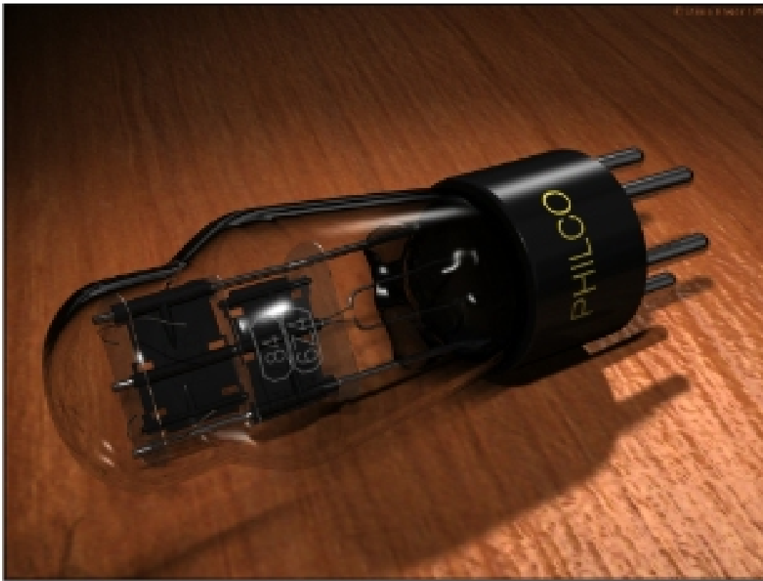
A Philco 6Z4 Vacuum Tube