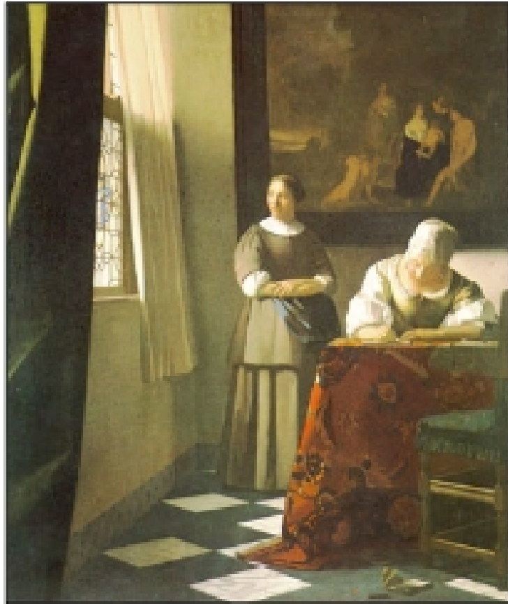
Lady writing a Letter with her Maid National Gallery of Ireland, Dublin Johannes Vermeer, 1670