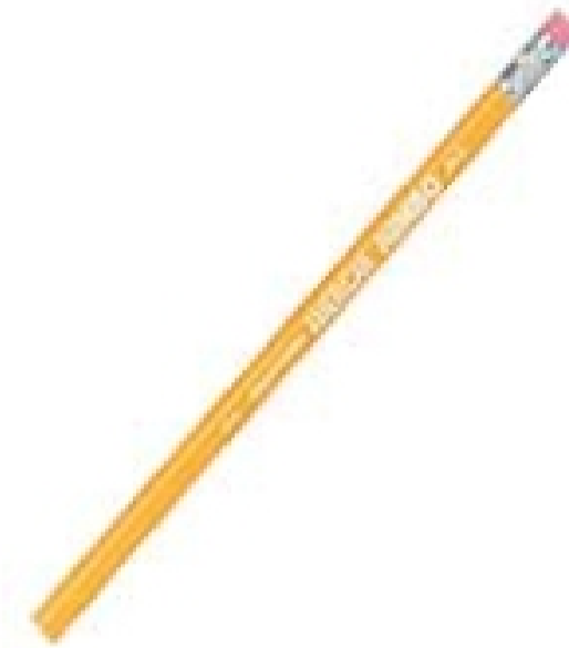
Russian Cosmonauts: A Pencil