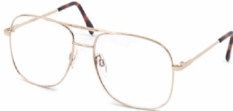
Glasses: Lens cloth