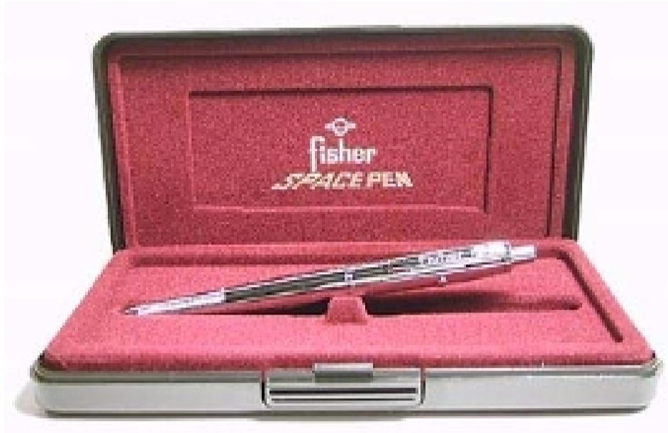
NASA space pen: Development cost 1-2 m$