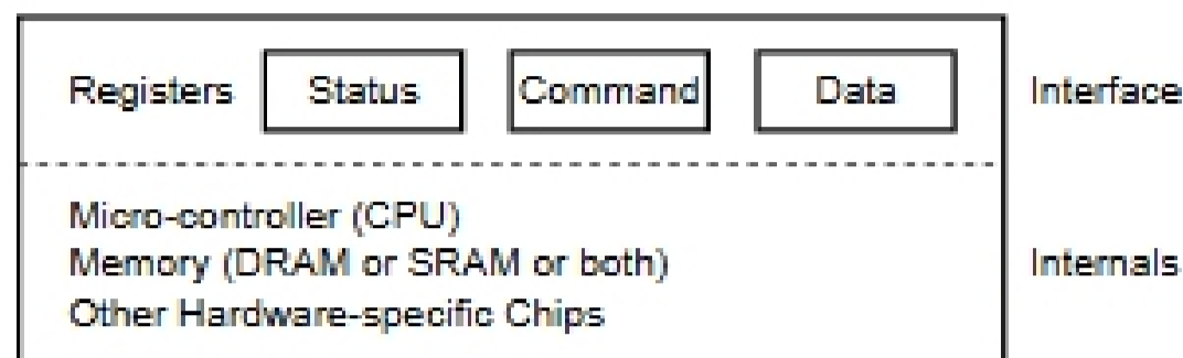
Figure 36.2: A Canonical Device