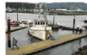
Crescent City 11/15/06

Hilo, Hawaii following 1960 M 9.5 Chilean Earthquake (61 fatalities)