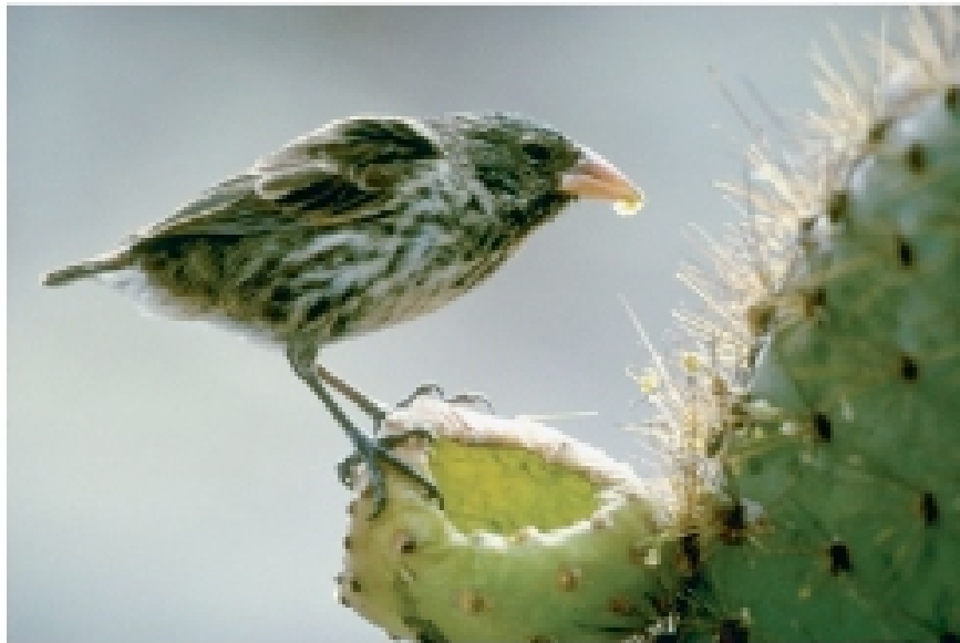
Mechanisms of evolution