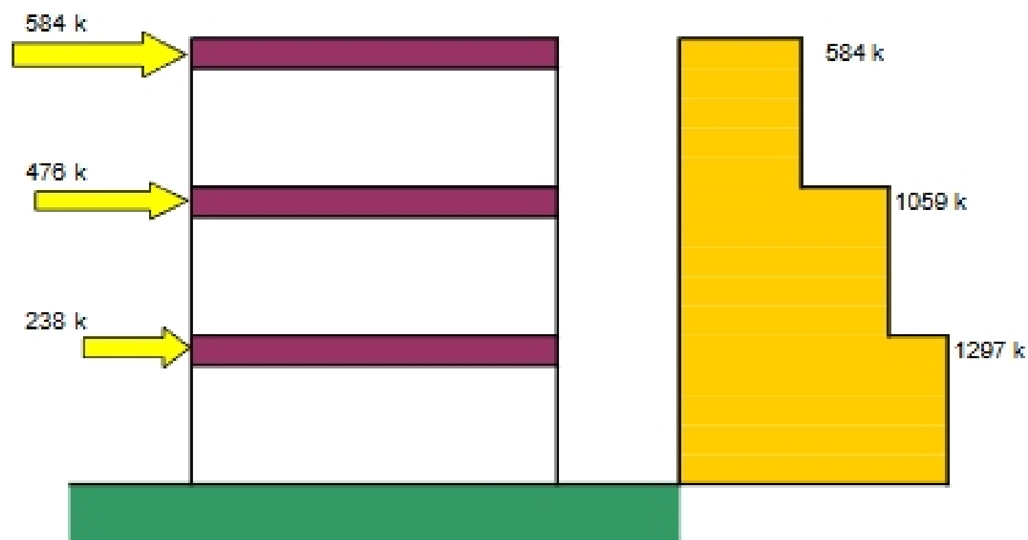
Figure 2: 1997 story forces and story shears (ultimate level, as the code writers intended)

Okay, we have wrapped up forced based seismic design. The main thing to note here is that we have only considered forces, not displacements. The building code is primarily a force-based method, where drifts are checked at the end and compared to an arbitrary allowable drift. Also observe that the demands have increased significantly between 1994 and 1997. This does not mean that earthquakes decided to become more damaging to our built environment during these three years, only that the code writers sought to make the provisions more closely reflect the seismic demands observed in recorded earthquakes. In both cases, however, the design forces are based on assumptions which may not be valid depending on the structure being designed, and the true behavior may vary substantially. It is this premise on which we enter the next phase of these course, and attempt to develop a rational framework though which seismic design may be objectively applied.