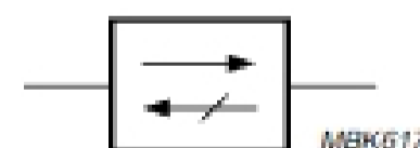
Fig.3 Symbol for an isolator.

An isolator is a passive non-reciprocal 2-port device which permits RF energy to pass through it in one direction whilst absorbing energy in the reverse direction.