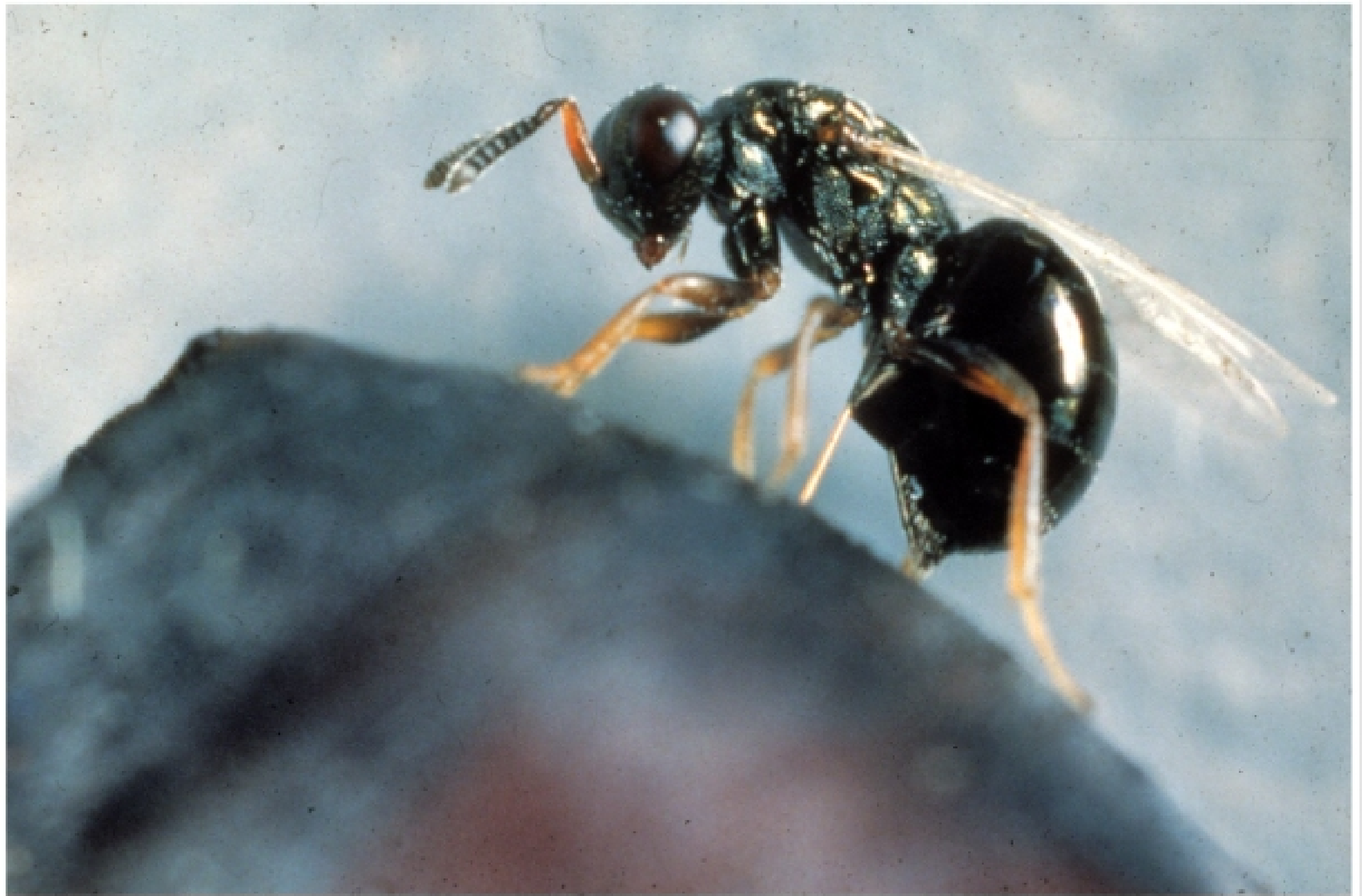
Figure 8.16 The Economy of Nature, Sixth Edition