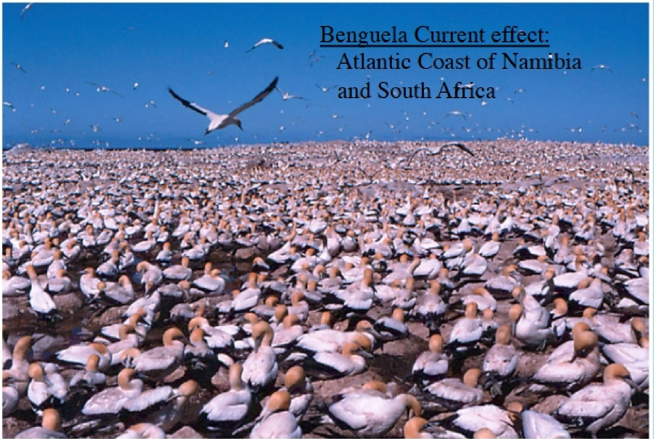
Figure 4.9 The Economy of Nature, Sixth Edition © 2010 W.H. Freeman and Company

...and the rest of the story, a la Carl Safina