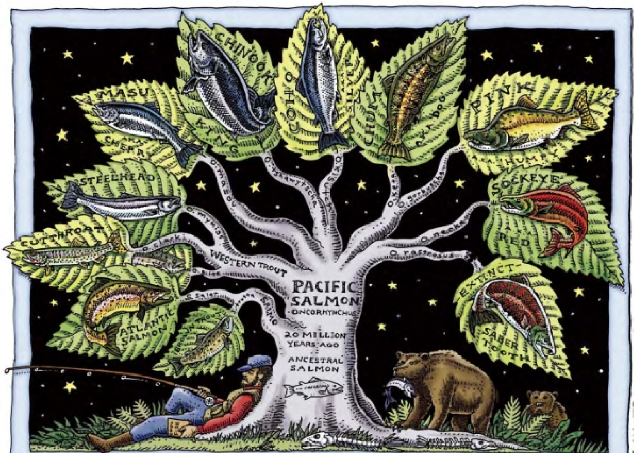
THE SALMON FAMILY TREE