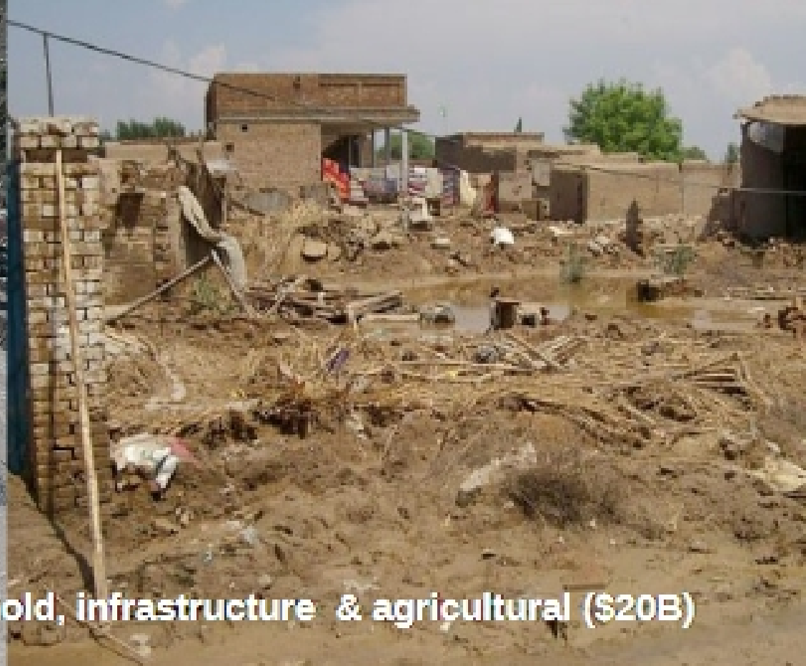
2000 lives lost, extensive livestock, household, infrastructure & agricultural ($20B)