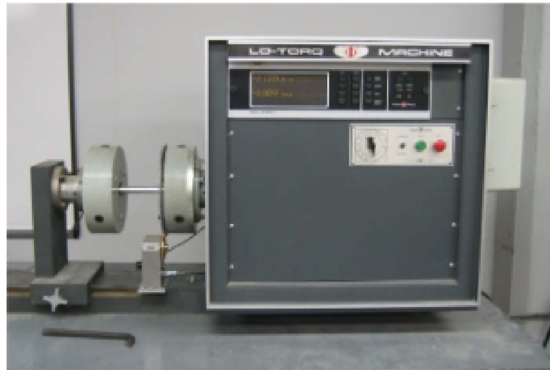
Figure 1.2.1. T-O Lo-Torq torsion machine