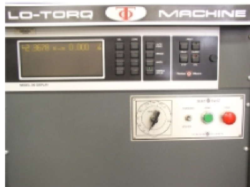
Figure 1.2.4. Torsion controls.