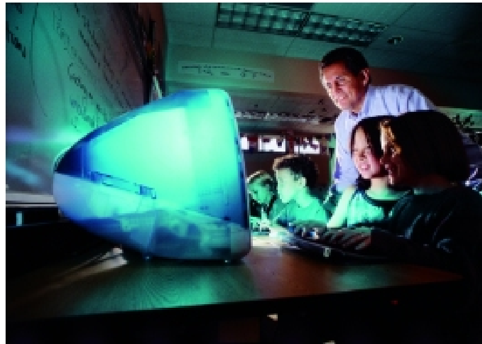
Royalty Free Stock Photography