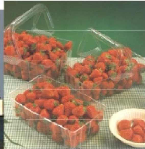
Clear polystyrene articles