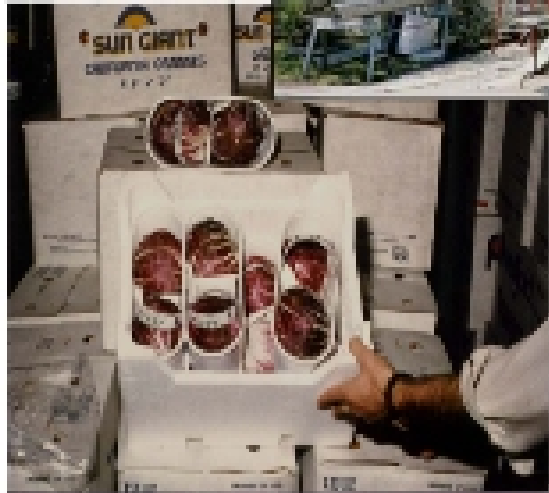
Foamed polystyrene articles