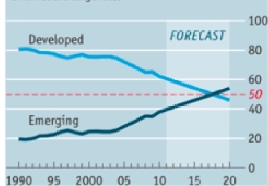
Economies' share of world GDP, % At market exchange rates